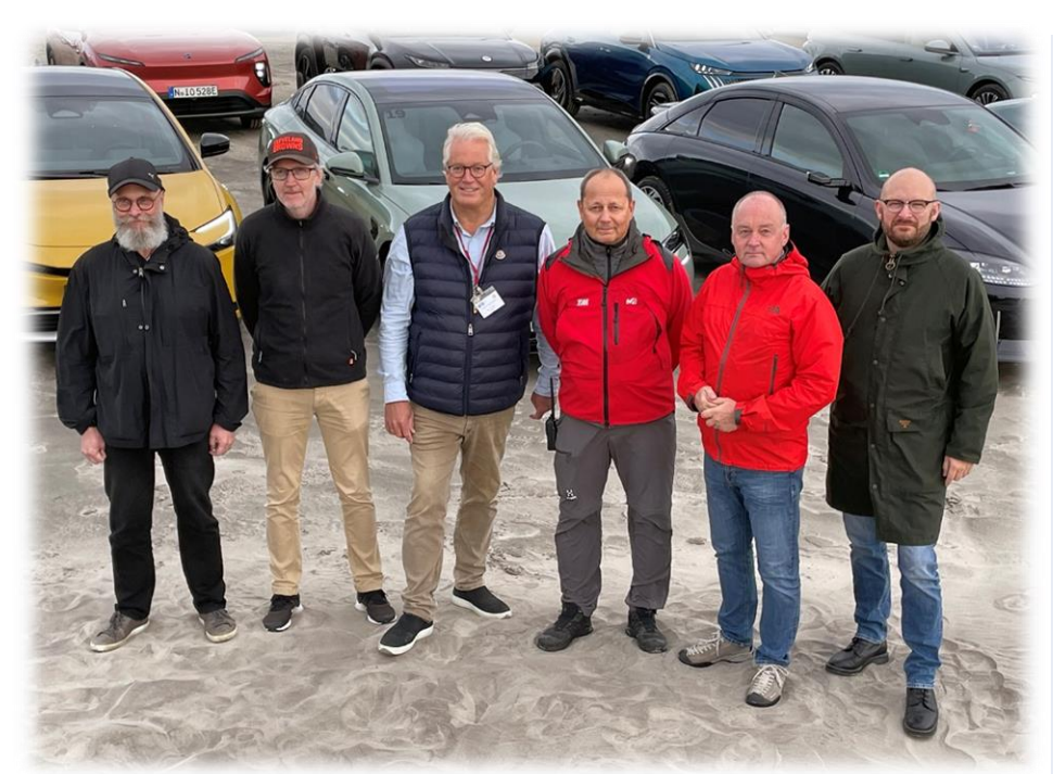
The six members of the Nordic Jury Group is behind the Tannistest.

45th year · Issue 6 · Thursday, 28. September 2023